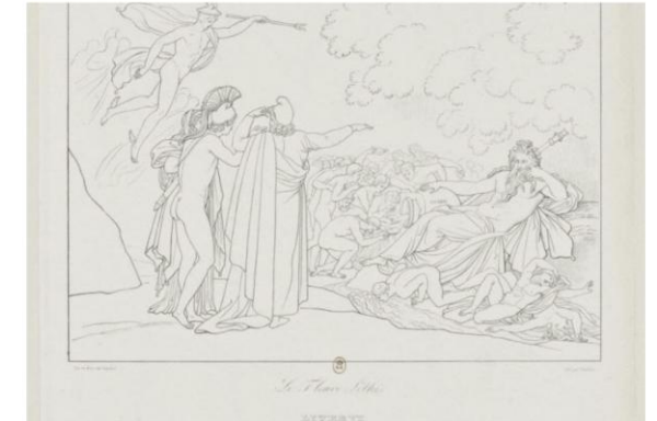
Le fleuve Léthé, composition lithographique de Girodet-Trioson tirée de l'Enéide et des Géorgiques de Virgile, 1827, Bibliothèque nationale de France